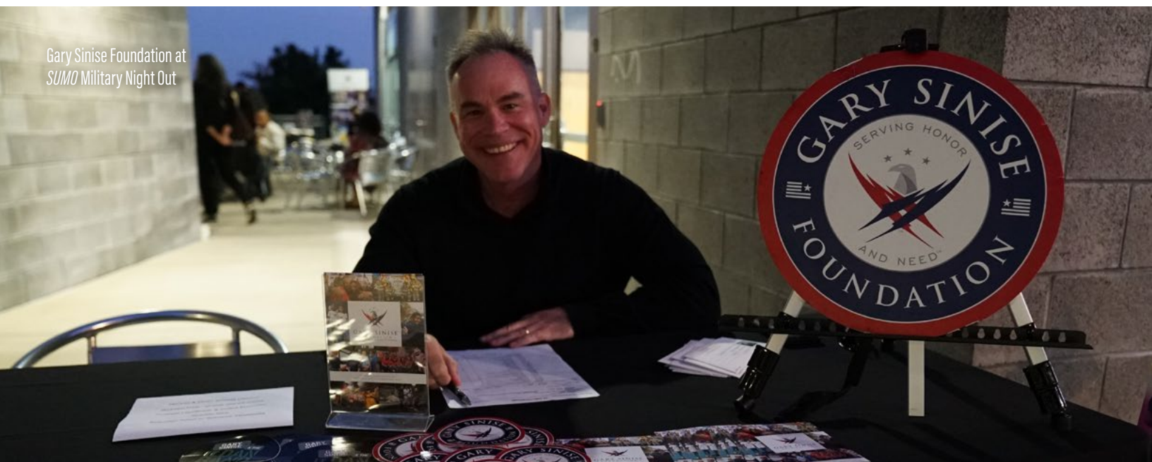
Gary Sinise Foundation at SUMO Military Night Out