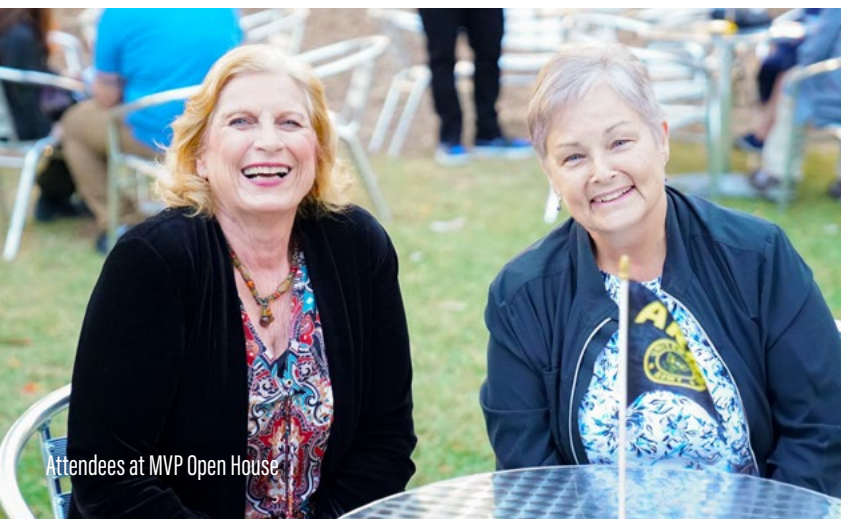
Attendees at MVP Open House

The MVP Open House for Veterans Day, held on Monday, November 6, 2023, welcomed members of San Diego's military community to La Jolla Playhouse for an appreciation event. The Playhouse's entire military contact list – which includes members of all military branches, active-duty, veterans, and their guests – were invited to participate. Attendees experienced a captivating performance by the Marine Band of San Diego and enjoyed an engaging tour of our theatre spaces and production shops. Complimentary food and beverages, generously provided by the Gary Sinise Foundation, enhanced the evening for the 100 attendees , contributing to a truly memorable occasion.