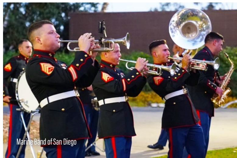
Marine Band of San Diego