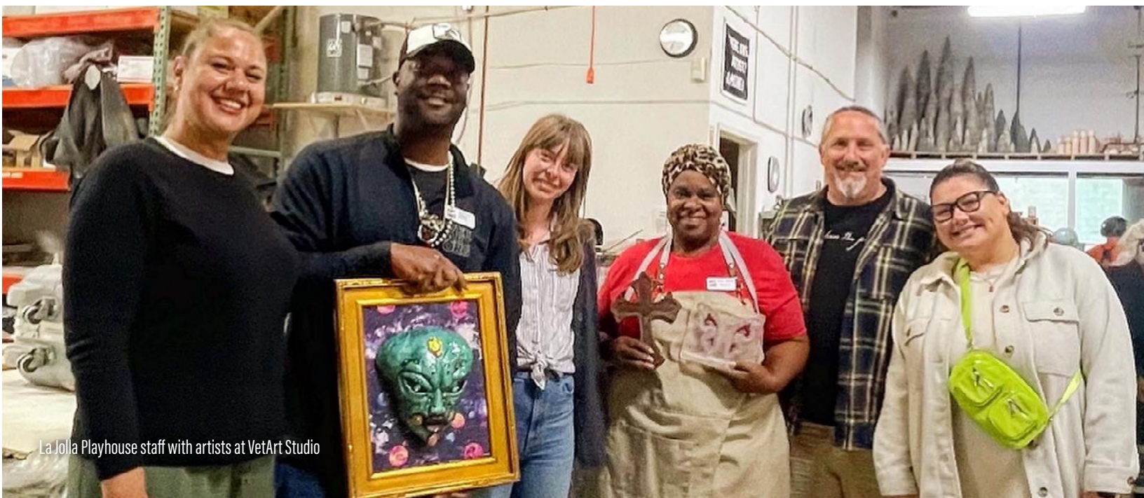
La Jolla Playhouse staff with artists at VetArt Studio